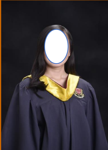
Photo A Sample Toga Shot