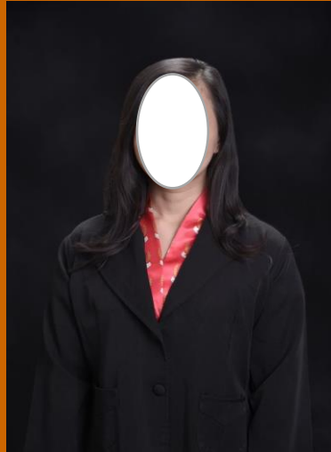
Photo B Sample Corporate Shot