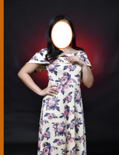
Photo C Sample Glam Shot