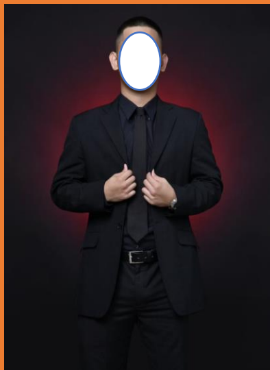
Photo B Sample Glam Shot