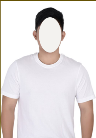
SAMPLE PHOTO for Toga and corpo

This photo will be edited for your Toga and corpo picture. Use a plain white and clutter-free background. Arms on the side.