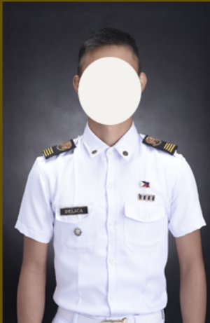
SAMPLE Uniform photo for maritime

Hair should be neat with the prescribed hair cut.