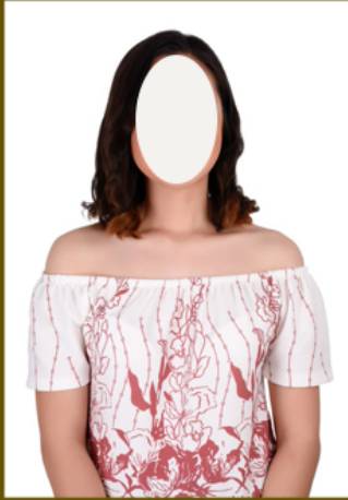
SAMPLE PHOTO for Toga and corpo

This photo will be edited for your Toga and corpo picture. Use a plain white and clutter-free background. Arms on the side.