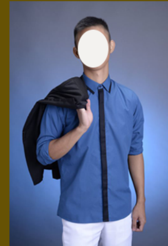
Sample photo for glam

Glamour photo with light background. Hand props and statement boards not allowed.