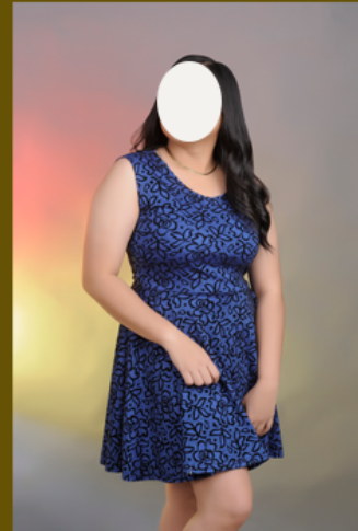
Sample photo for glam

Glamour photo with light background. Hand props and statement boards not allowed.